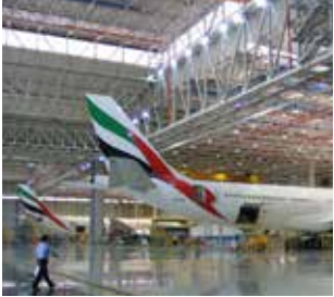
Sikafloor® protective flooring solutions for aircraft hangars and other specific applications.