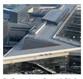
Roofing and reroofing with Sika® Sarnafil® and Sikalastic® RoofPro® membrane systems.