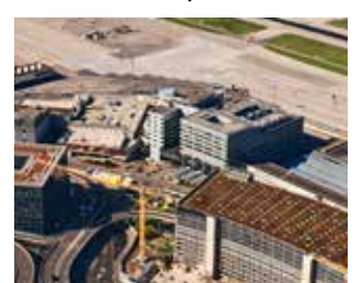
Zurich Intl. Airport, Kloten (Switzerland): Sika® Sarnafil® roofing membrane, Sikafloor® flooring systems, SikaCor® protective coating for structural steel, Sika® ViscoCrete® and other Sika concrete admixtures.