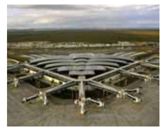
Hammamet Intl. Airport, Enfidha (Tunisia): Sika® ViscoCrete® and Sikament® concrete admixtures, Sika® Waterstops, Sikadur® adhesives, Sika® Monotop® and SikaTop® repair mortars, Sika® Carbodur® strengthening systems, Sikaflex® and Sikasil® sealants.