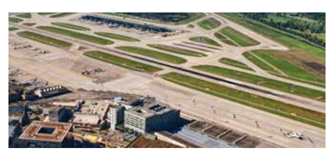
Sika Solutions for concrete construction include systems for waterproofing of structures, admixtures for the production of various types of concrete, mortars for concrete repair and maintenance, and much more...