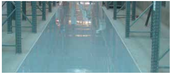
SikaGrout®, Sika AnchorFix®, SikaTop®, etc.: Solutions for structural/heavy-duty anchoring and grouting (chemical anchoring, cementitious or polymer-based grouts) and specialty mortars for concrete work.