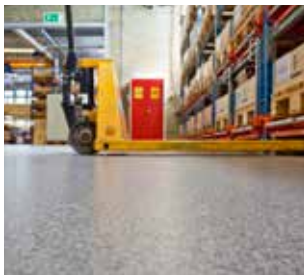
Sikafloor® industrial flooring solutions for warehouses, distribution centres and logistics platforms.

Sustainability and Protection of the Environment: As a member of the CaGBC and a trusted supplier of construction materials for LEED projects in Canada, Sika Canada contributes to the green building process.