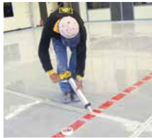
Sikaflex®, Sikasil® & Sikadur®: Sealants and adhesives for joints in warehouse floors and façades.