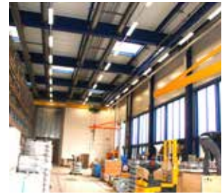
Corrosion and fire protection of structural steel structures with SikaCor® and Sikacrete® 213F.