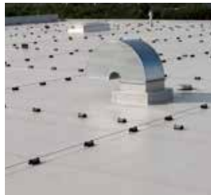
Roofing and re-roofing with Sika® Sarnafil® and Sikalastic® RoofPro® membrane systems.