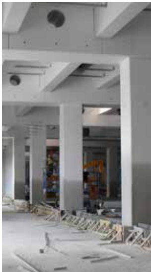
Sika® ViscoCrete®, SikaRapid®, Sika® Control, Sika® Fiber, Sika® Air and much more : A complete range of high performance admixtures for cast-in-place, precast and concrete paving applications.