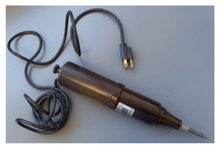
Figure 5: Holiday Spark Tester

Sika® Greenstreak sells Spark Testers shown in the figure below: