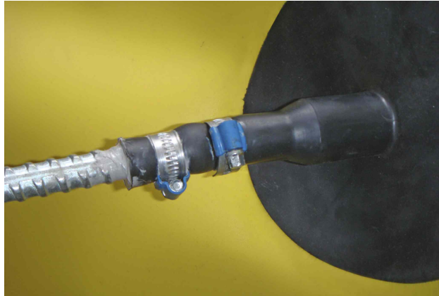
Preconditions Sikaplan® sheet membrane is installed according to the

FOR USAGE AS SEALING ELEMENT FOR ANCHOR PENETRATIONS