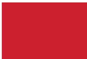
316 / SAFETY RED