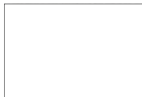
433SW / SUPER WHITE