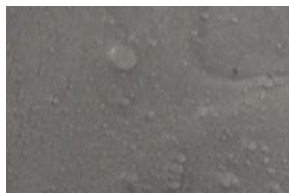
101 / SILVER METALLIC

Available colours of Sikafloor® UTE Colour Pak: