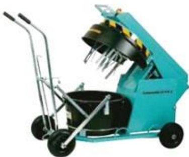
Forced action pan mixer Large quantities