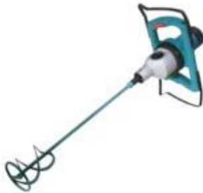
Single mixer with spindle paddle Small quantities