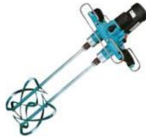
Double mixer with spindle paddle Medium quantities