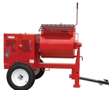
Drum mortar mixer Large quantities